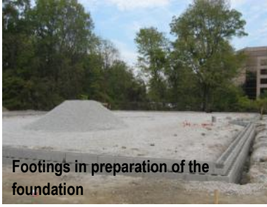
Footings in preparation of the foundation