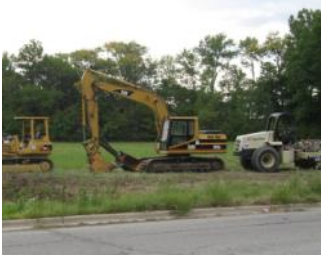
Initial ground work in Sep. 2007